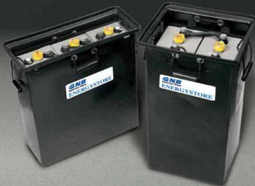
INCP DESIGN INT 2005 2011

Exide Technologies takes pride in its commitment to a better environment. Its Total Battery Management program, (an integrated approach to manufacturing, distributing and recycling of lead acid batteries), has been developed to ensure a safe and responsible life cycle for all of its products.